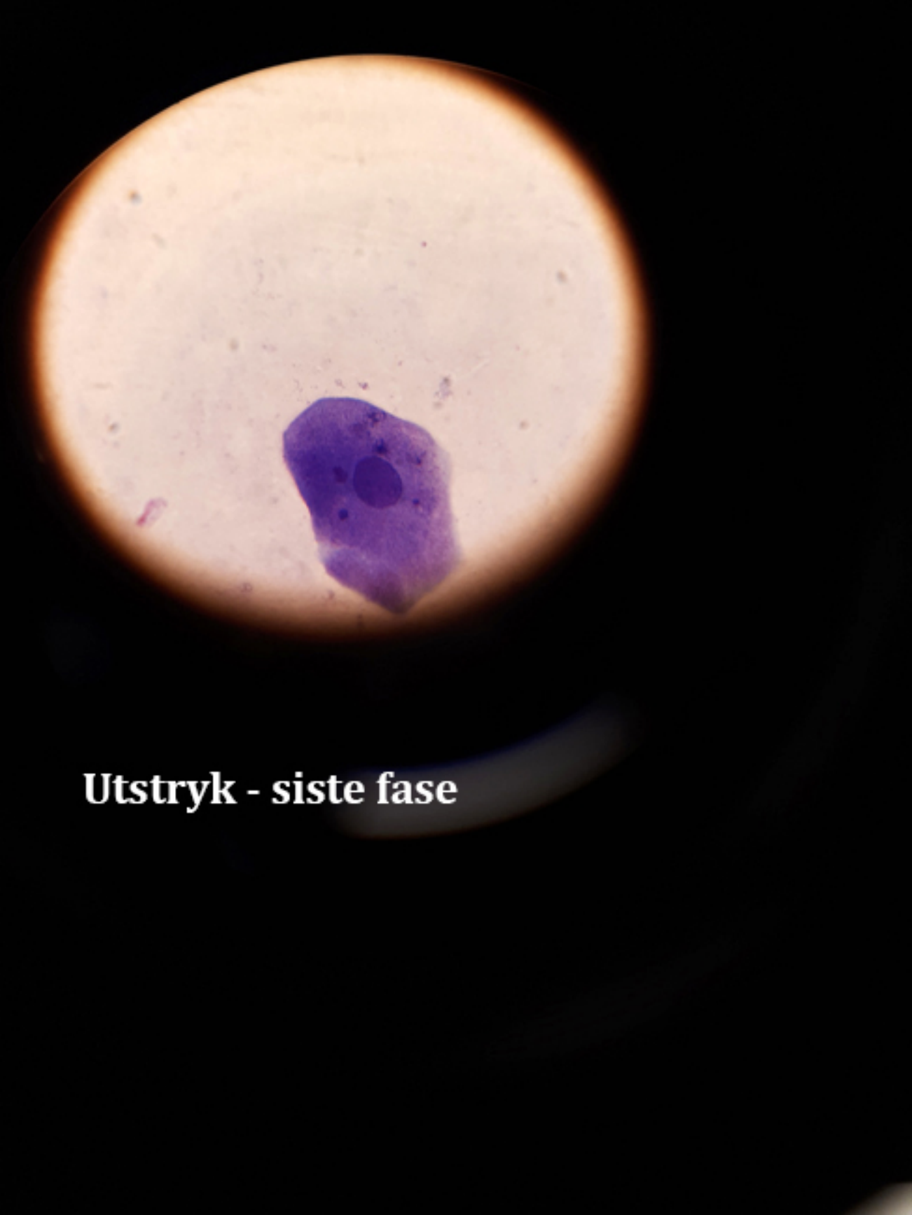
Utstryk - siste fase